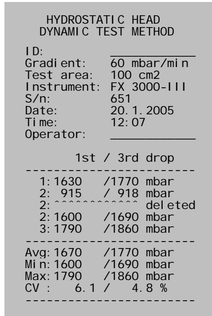
Test report, printed with the Strip Printer L 5130 MINIPRINT (original size).

Up to five different TEXTEST instruments can be connected to the PC at the same time. The test results from these instruments can be processed simultaneously and documented together on the same test report. Thus, the Evaluation Program L 5110 LABODATA III turns the PC into a complete data processing system for the testing laboratory.